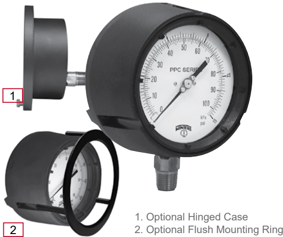
1. Optional Hinged Case 2. Optional Flush Mounting Ring